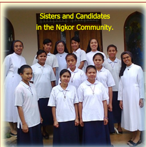
Sisters and Candidates in the Ngkor Community.