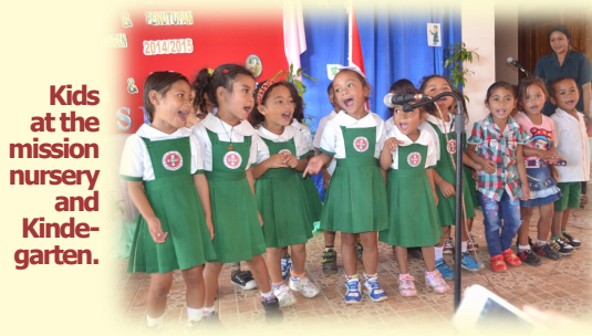
Kids at the mission nursery and Kindergarten.