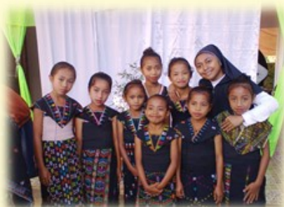
A catechism class.