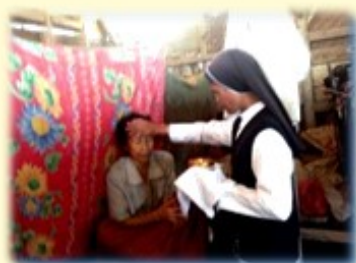
Visiting the lonely and the sick.