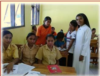
Youth Ministry at a public school in the vicinity of Ngkor.